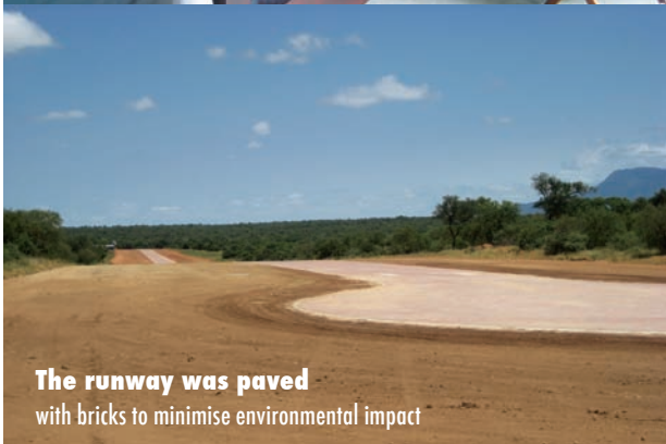
The runway was paved with bricks to minimise environmental impact

T O be able to experience the actual quality of life in Zandspruit, we were invited to spend a few nights at their lodge on the Aero Estate.