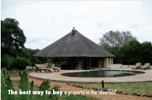
The best way to buy a property in the 'slowveld'