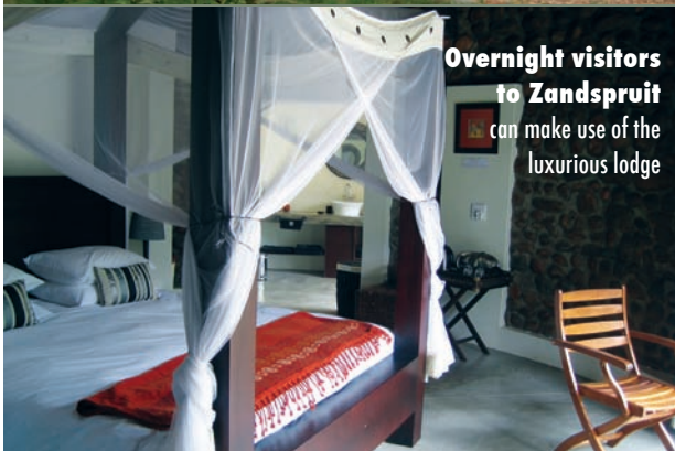
Overnight visitors to Zandspruit can make use of the luxurious lodge