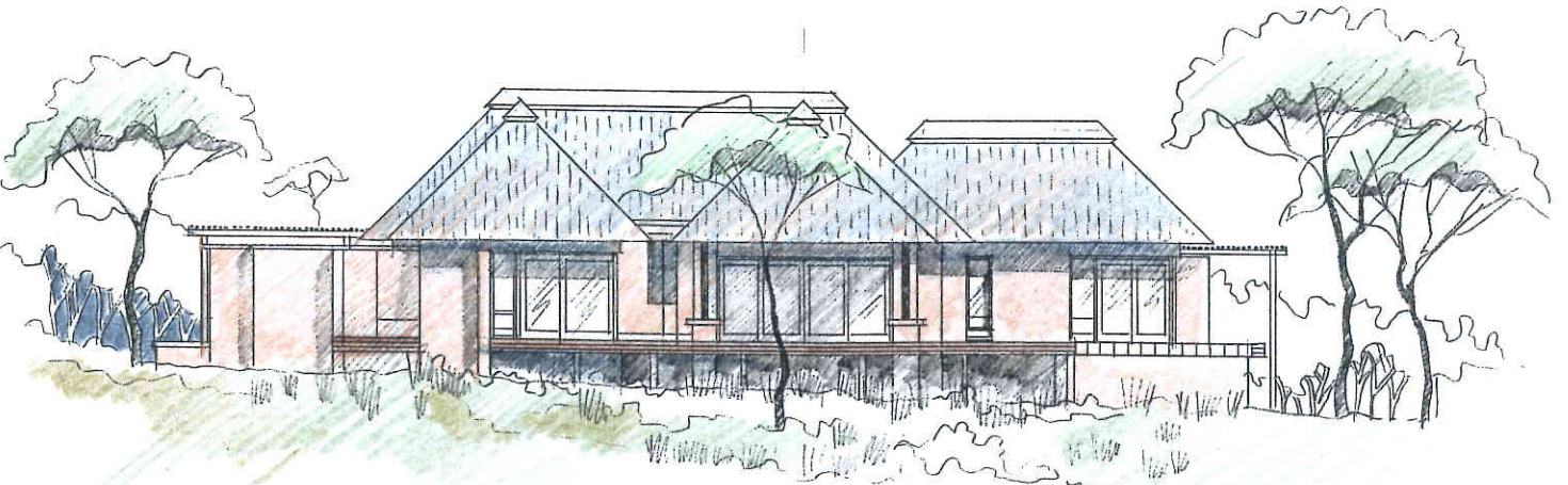
SOUTH ELEVATION 1:200